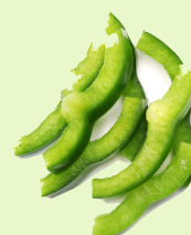
Green capsicum cut into long strips