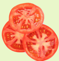
Tomato cut into circle slices