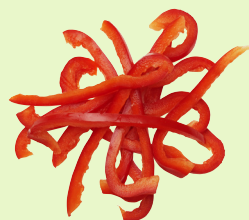
Red capsicum cut into long strips