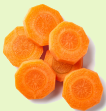
Carrot cut into circle slices